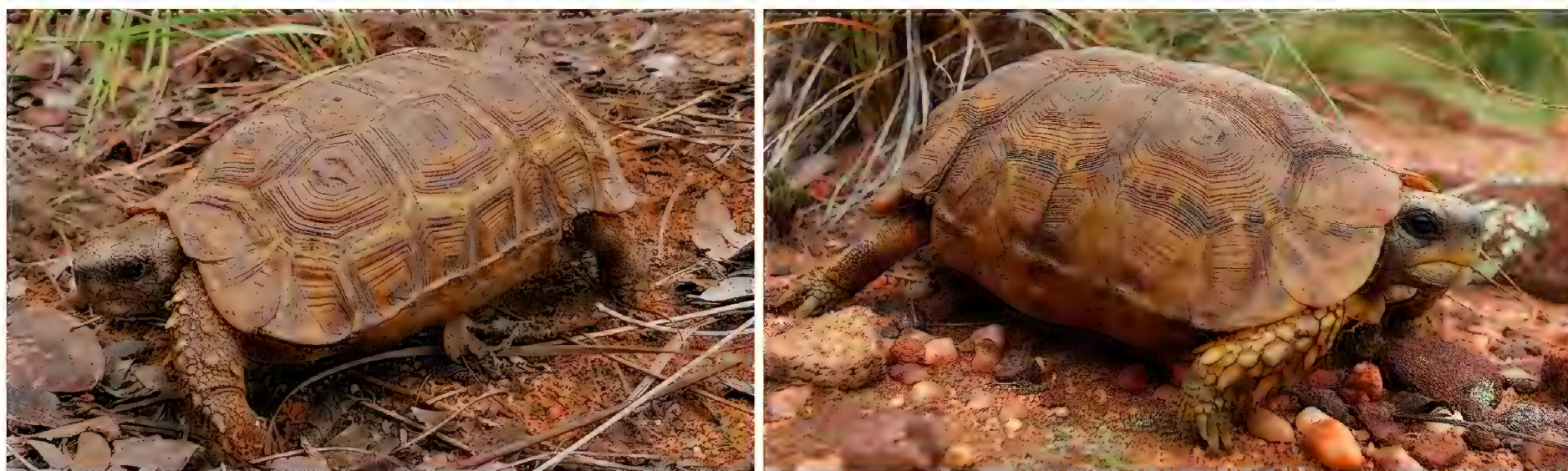
Fig. 5. Speke's Hinge-back Tortoise ( Kinixys spekii ) from the vicinity of Vaalwater (left) and Lobatse Hinge-back Tortoise ( K. lobatsiana ) from the Lapalala Wilderness Reserve (right) with very similar color patterns. Species identification of both tortoises was genetically confirmed.

photographs of hinge-back tortoises from this reserve in any of the databases that were queried. Branch et al. (1995) further highlighted the Marakele National Park (former Kransberg National Park) and the Blyde River Canyon Nature Reserve as important statutory protected areas where the species has been recorded. However, we are not aware of any contemporary records from either of these reserves. In addition to these published localities, the occurrence of K. lobatsiana from the following sites was confirmed: